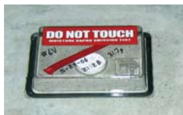
Fig. 2: Typical calcium chloride test kit containing a dish, calcium chloride crystals, and a plastic dome

moisture vapor in the air beneath the plastic dome. At the end of the exposure period, the difference between the initial and final weight of the crystals is used to calculate the MVER in pounds of water per thousand square feet per 24 hours (commonly referred to simply as “lbs”).