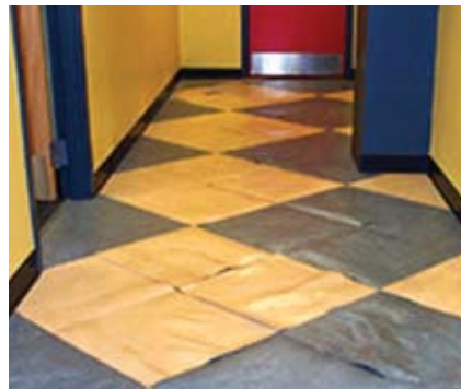
Fig. 1: Problems such as these warped and bubbled floor tiles can be caused by moisture and moisture-induced high pH levels beneath the flooring materials

To understand what happened on this project and many others, we must examine a test method that is commonly used in the U.S. to quantify the moisture vapor emission rate (MVER) of a concrete subfloor. The method, the calcium chloride test developed by the Rubber Manufacturers Association (RMA) in the 1950s, is now published as ASTM F 1869 1 by ASTM International. MVER testing by the calcium chloride method involves placing an open dish containing a specified, known weight of anhydrous calcium chloride crystals beneath a plastic dome that is sealed to the concrete surface for 60 to 72 hours (Fig. 2). During the test, the crystals absorb